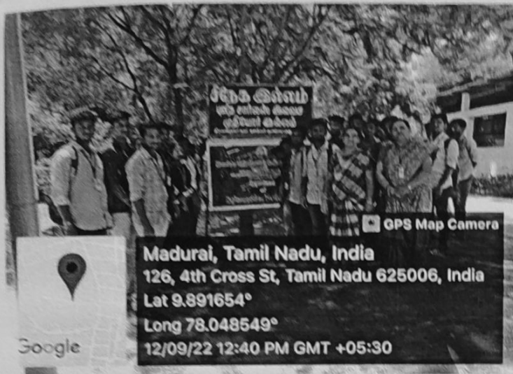
Faculties and Students are visited to home