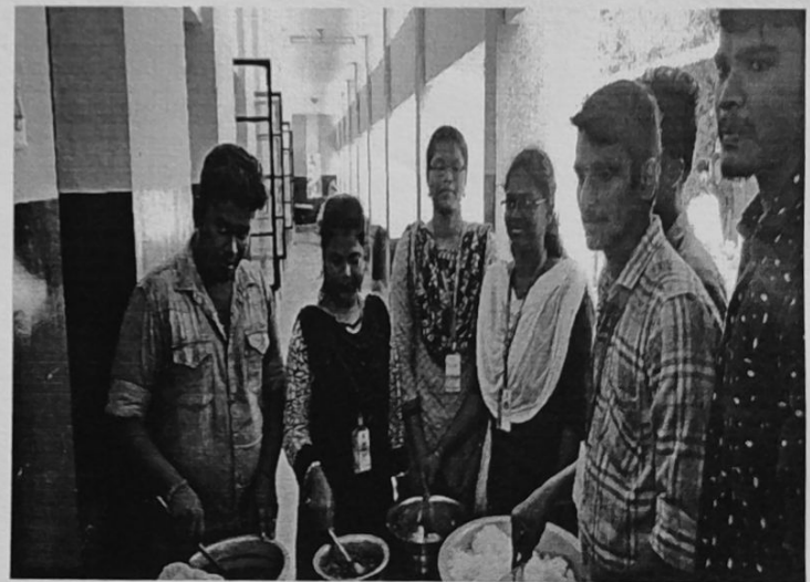
Our students distributed food to them