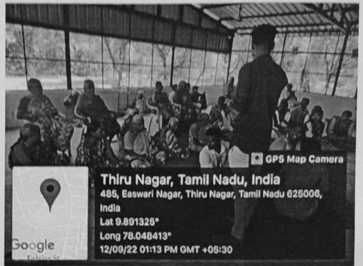
Students are interacted with people